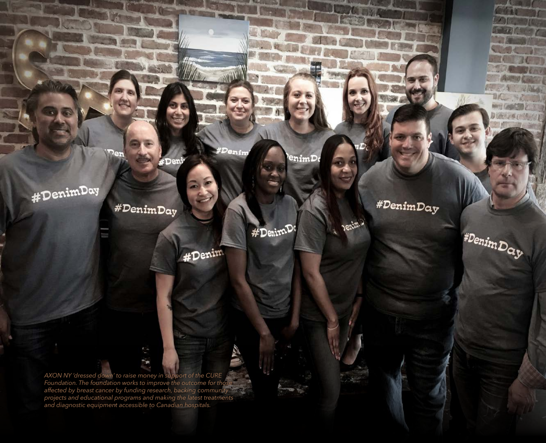
AXON NY 'dressed down' to raise money in support of the CURE Foundation. The foundation works to improve the outcome for those affected by breast cancer by funding research, backing community projects and educational programs and making the latest treatments and diagnostic equipment accessible to Canadian hospitals.