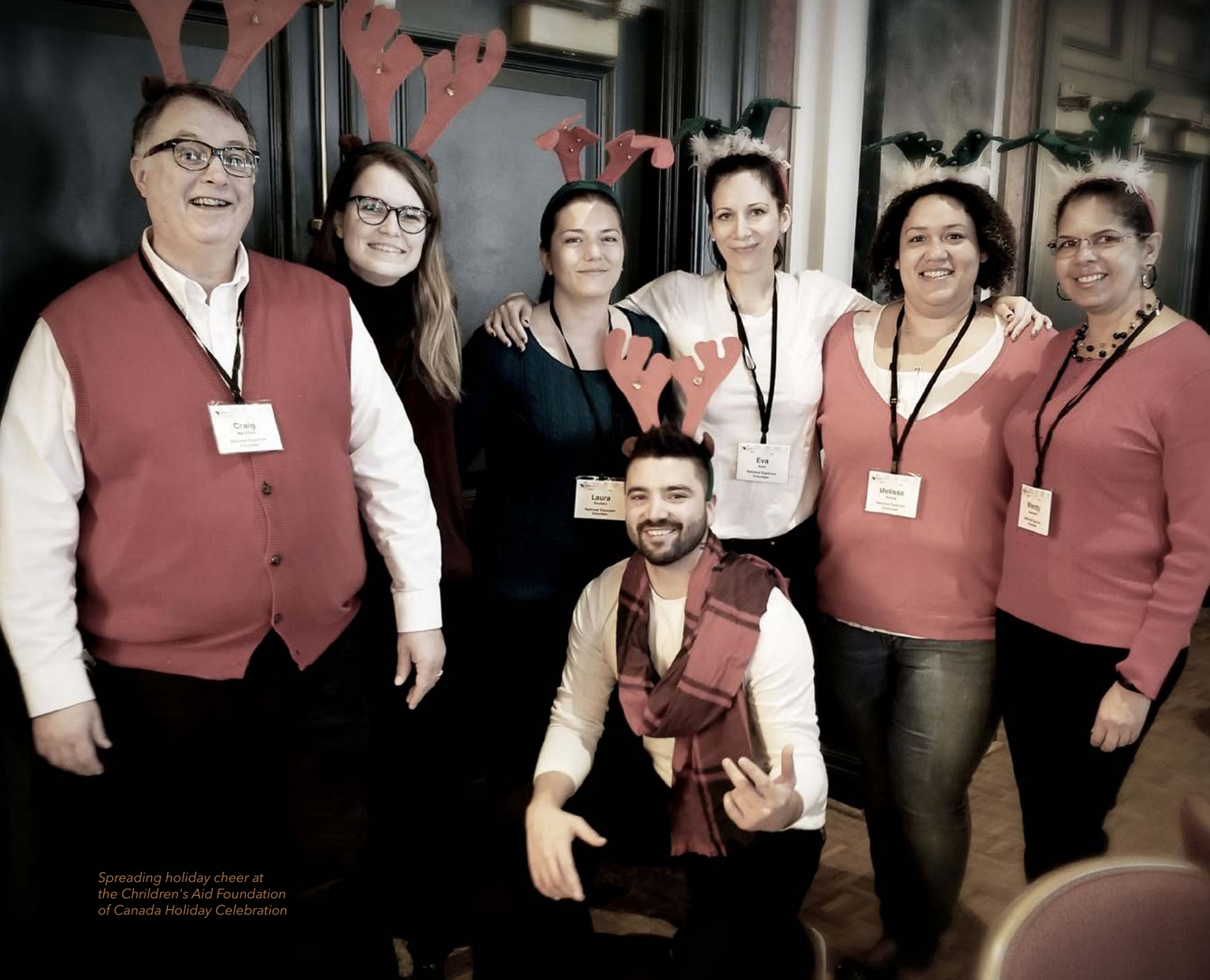
Spreading holiday cheer at the Children's Aid Foundation of Canada Holiday Celebration